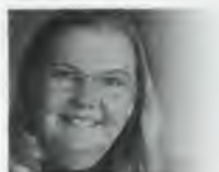
KATHI APPELT, AUTHOR, POET:

The result is always a kind of magic, on both sides: students come away fired up about the possibilities of their own creative work, and the visiting artists come away fired up about our students, which is why so many of them come back for more."