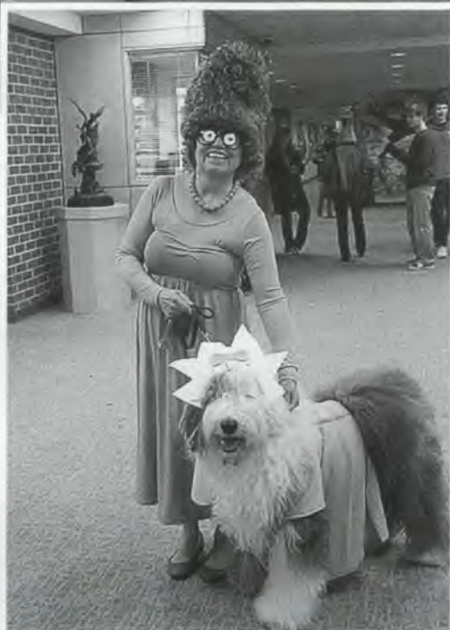
The Middle School Tradition Continues: Mini Course Week!

Combining perennial favorites like "The Amish Experience," "Chocolate Immersion," "Gettysburg," and "New York, New York" with new and returning offerings, such as "Sport!," "Solar Service," "Farm Week," and "Cape Cod," this year's Mini Course Week offered an array of wonderful opportunities for every Middle School student.