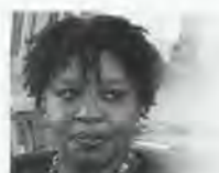
NIKKI GRIMES, AUTHOR, POET:

There is no doubt that we are better people as a result of these experiences."