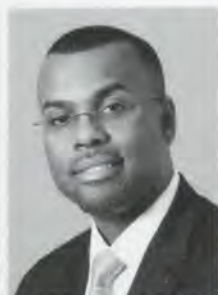
Eddie S. Glaude, Jr.