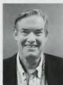
David R. Scott