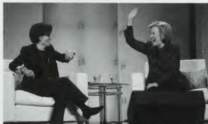
Kara Swisher '80 and Hillary Clinton share a high-five during a recent interview.

"Kara and I have been close friends and working partners since the 1990s," says Mr. Mossberg, a former Wall Street