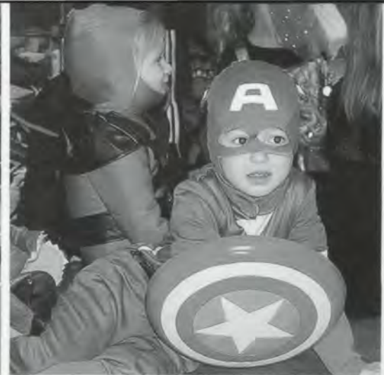
The Annual Halloween Parade