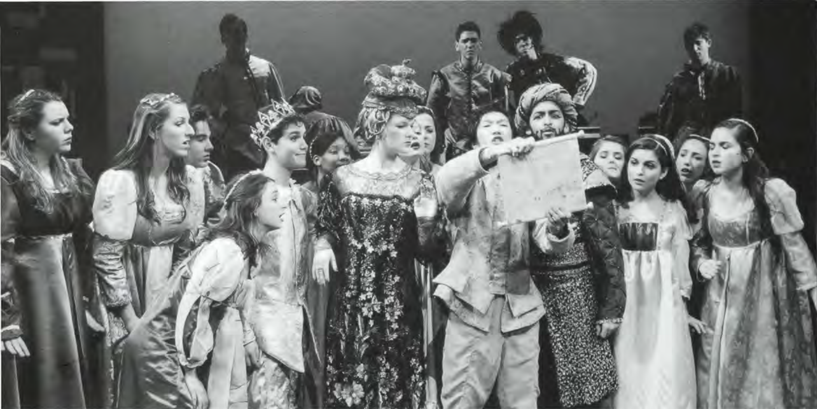
A scene from the Upper School winter musical, "Once Upon a Mattress." Princeton Day School's theater program was named top in the Northeast by Stage Directions Magazine. (Page 6)