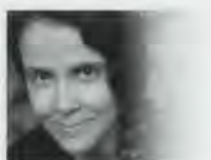
NAOMI SHIHAB NYE, POET, AUTHOR, SONGWRITER: