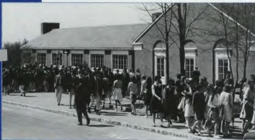
Princeton Day School, Opening Day, 1965

Princeton Day School is requesting from our alums any photos or interesting archives from the first day and year of school that can be featured online or in printed pieces during our anniversary year. Please send any photos or archives to communications@pds.org . Thank you!